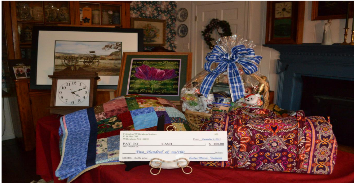
Back Row: New Mexico photo landscape, Needlepoint cosmos flowers, 4 select wine basket with goodies Front Row: Black walnut clock, Timeless handmade quilt, $200 cash, Designer Vera Bradley Travel Bag