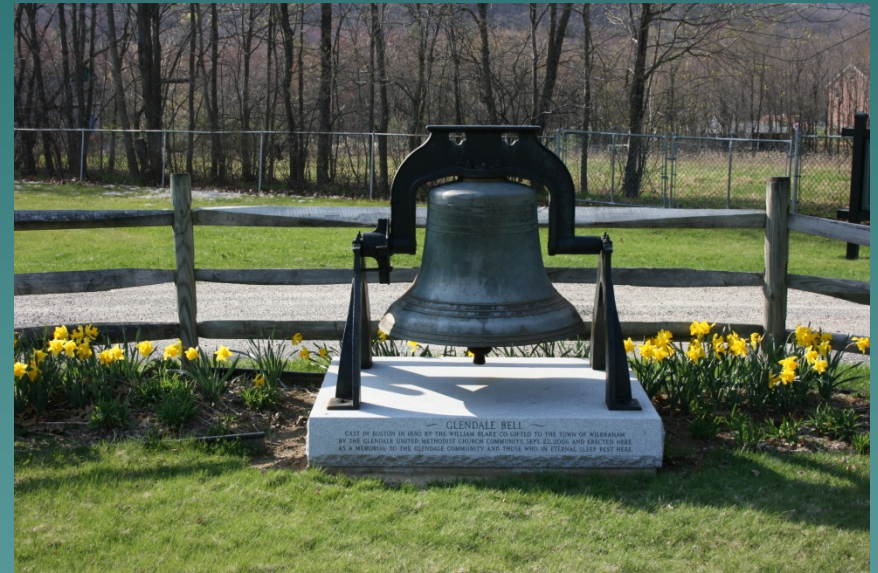
◆ Glendale Bell