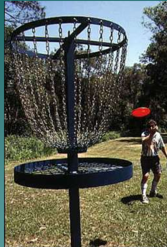
◆ Crane Hill Disc Golf