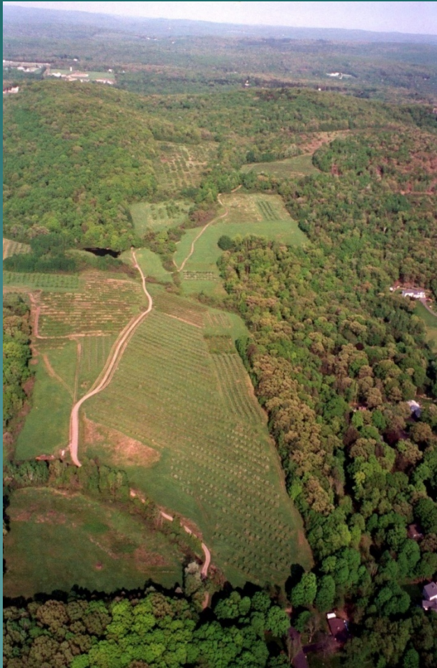
◆ Rice Farm