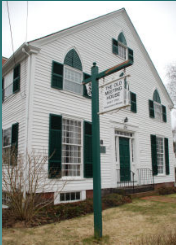
◆ Old Meeting House- Restoration