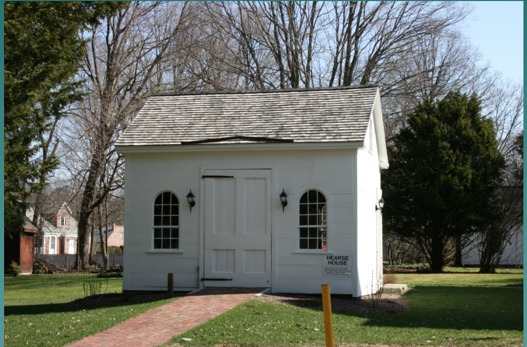
◆ Hearse House