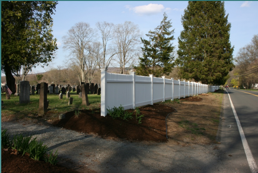
◆ Adams Cemetery Fence