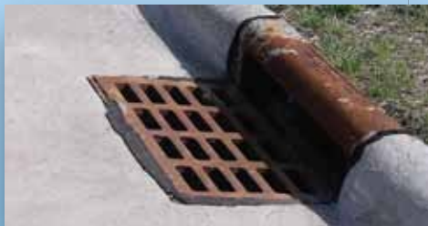
Storm Drain / Catch Basin

The sewer system takes all wastewater from toilets, sinks and showers to a wastewater treatment facility, where the water is treated before it is discharged to a water body.