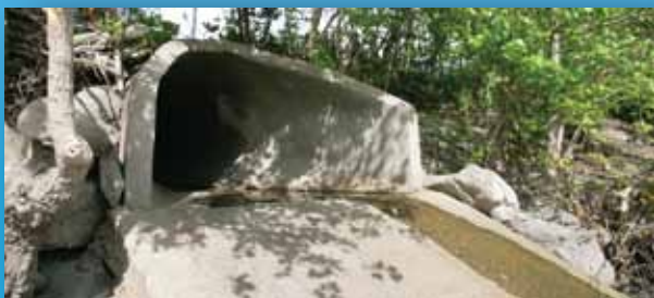
Storm Drain Outfall

The storm drain system , on the other hand, collects rainwater from city streets and urban areas to prevent flooding. Unfortunately, chemicals, oil, trash and other debris that have been spilled accidentally or intentionally can also enter the storm drain system. The water from storm drains typically flows untreated to a nearby stream, river or other water body, causing water pollution.