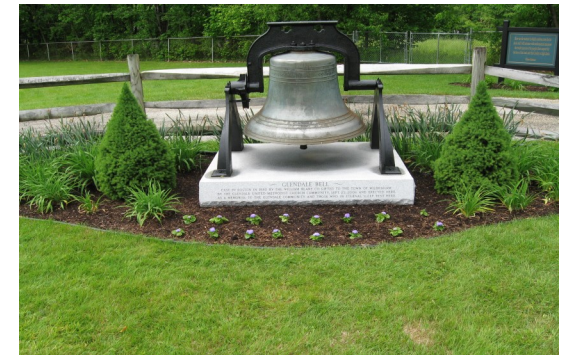
Bell from the former Glendale Church

TRUST FUNDS . . . . . A LASTING MEMORIAL The Town of Wilbraham maintains a Perpetual Trust Fund dedicated to the maintenance and improvements of Adams, East Wilbraham, and Glendale Cemeteries. A contribution in any amount will be gratefully accepted. The Fund is set up so that only the interest income is used. The principal is accumulated and remains in the Trust Fund Account. Each Commissioner is available to discuss the Trust Fund.